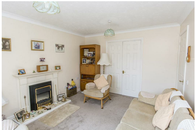
Lounge (Photo Two)

The lounge has a fireplace housing an electric fire. A set of patio doors open into the well maintained garden. Decorative coving to the ceiling.