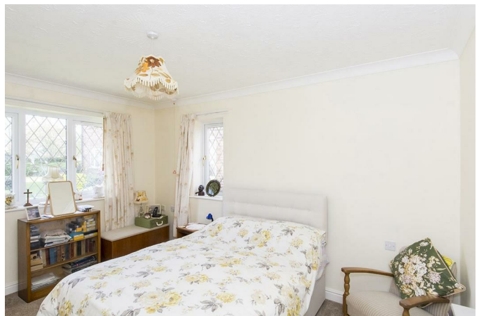
Bedroom One (Photo Two)

This double bedroom has a window to the front aspect. This bedroom benefits from built in wardrobes and an electric storage heater. A window to the rear and side aspect.