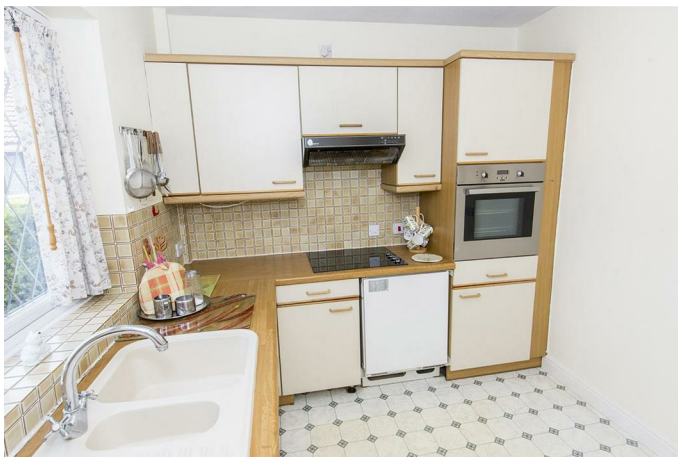
Kitchen 8'1" x 9'9" (2.46m x 2.97m)

Fitted with cabinets with complimenting work surfaces, bowl and a half composite sink plus mixer taps, eye level oven, new electric hob and extractor fan. Integrated fridge freezer. Windows to both the front and side aspects. Vinyl flooring throughout.