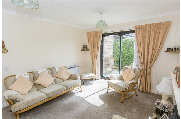
Lounge 13'11" x 10'11" (4.24m x 3.33m)

The lounge has a fireplace housing an electric fire. A set of patio doors open into the well maintained garden. Decorative coving to the ceiling.